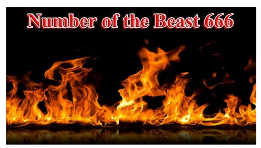
Click here to watch the video from our website

Rev 13:18 says, "Here is wisdom. Let him that hath understanding count the number of the beast: for it is the number of a man; and his number is Six hundred threescore and six."