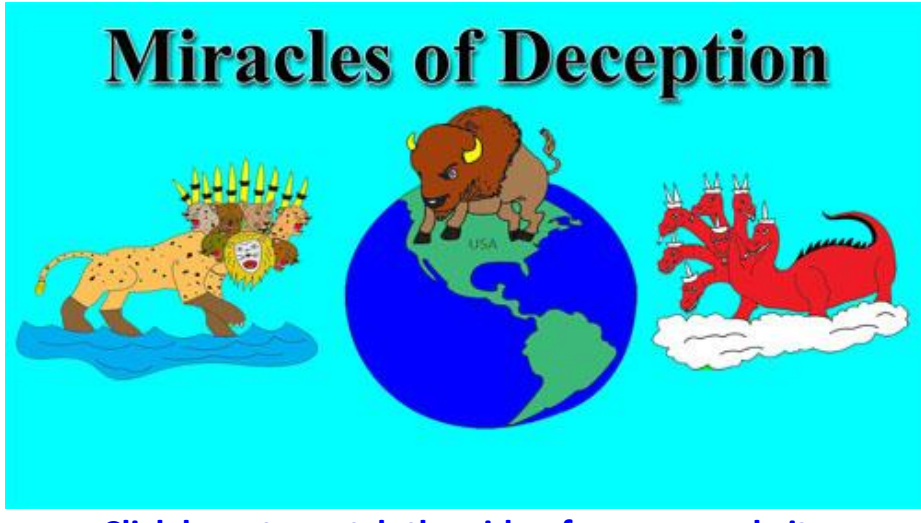
Click here to watch the video from our website

Satan wants to deceive you, but God loves you and wants to save you from Satan's deceptive miracles. In our last 3 videos the Bible has identified the Dragon of Revelation 12 as Satan. The Leopard beast of Revelation 13 as the Papacy, and the beast with 2 horns like a lamb as the United States of America.