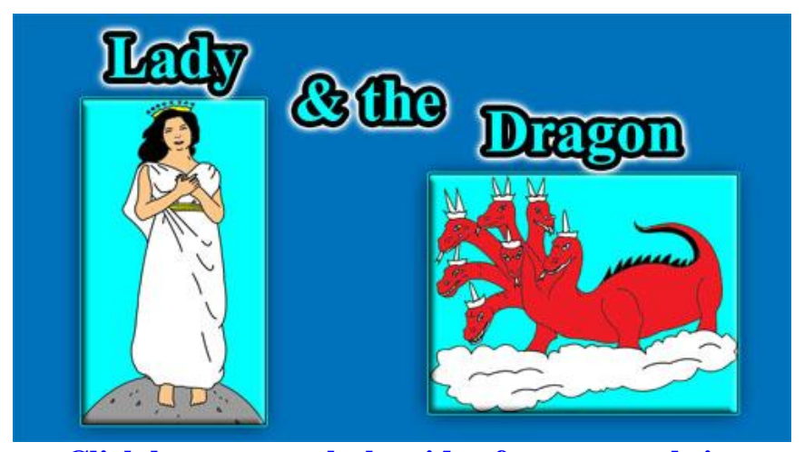
Click here to watch the video from our website

Lady and the dragon depicts the great battle between good and evil, between those who follow God, and those who are deceived by the dragon.