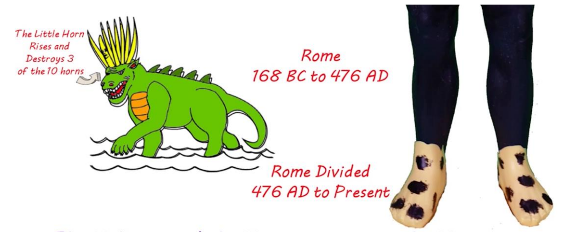
The 10 horns and the 10 toes represent the 10 nations that remained after Rome fell in 476 AD Remember: Daniel 2 & Daniel 7 are Parallel Prophecies

The fourth beast was a dreadful, terrible, and exceedingly strong beast with great iron teeth. This beast with its iron teeth represents the same kingdom as the iron legs. Those legs represented the Pagan Roman Empire.